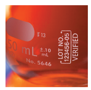
Each flask is labeled with "VERIFIED" and a lot number. With this information you can access a Certificate of Analysis with lot specific data regarding both measurements and methods.

• Other Types: There are also some specifications for other calibrate glassware, set by various Federal Bureaus or professional societies. Tolerances for these and references to the specification are found in Corning's laboratory catalog under individual product descriptions.