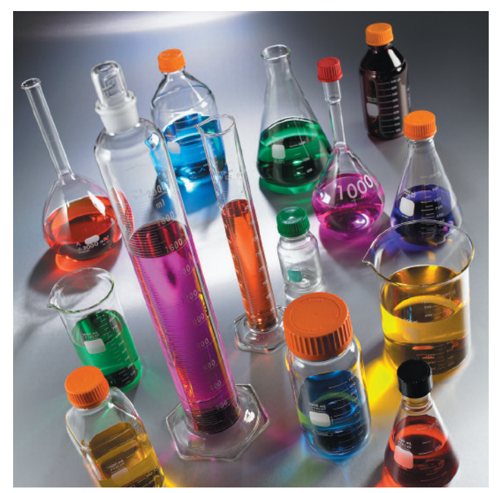
For over 90 years PYREX glass has provided researchers with high quality, corrosion and thermally resistant laboratory glassware.

Never fill a receptacle with material other than that specified by the label. Label all containers before filling. Dispose of the contents of unlabeled containers properly. All bottles and