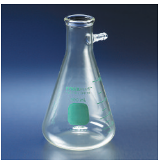
PYREXPLUS coated heavy wall filter flasks are ideal for vacuum aspiration.

PYREXPLUS containers have demonstrated the ability to contain glass fragments upon implosion at room temperature. Only the 250 mL to 2L screw cap round storage bottles and the filter flasks are recommended for use under vacuum applications. In keeping with safe laboratory practice, always use a safety shield around vessels under negative pressure.