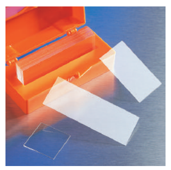
Corning Disposable Glass Coverslips offer ultra-flat glass in several thicknesses to give optimal viewing with highpowered microscope objectives.