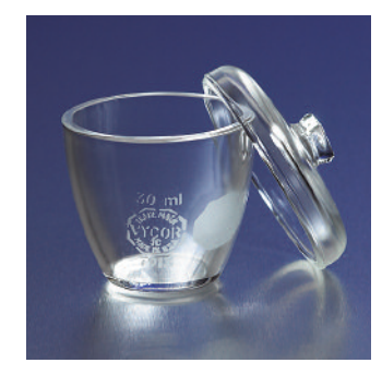
When it comes to use at very high temperatures, VYCOR<sup>®</sup> glassware outperforms all other glass formulations.