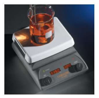
Corning offers digital hot plates that can also stir and control the temperature of the solution stirring in the vessel.

Corning<sup>®</sup> Digital Hot Plates have a PYROCERAM<sup>®</sup> top made of a glass-ceramic mate-