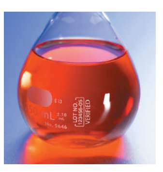
Corning<sup>®</sup> 5646 series VERIFIED volumetric flasks are guaranteed to meet Class A volumetric tolerances on every single flask.