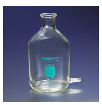
PYREXPLUS<sup>®</sup> glassware has a tough plastic coating on the outside and PYREX glass on the inside for increased safety and reduced breakage.