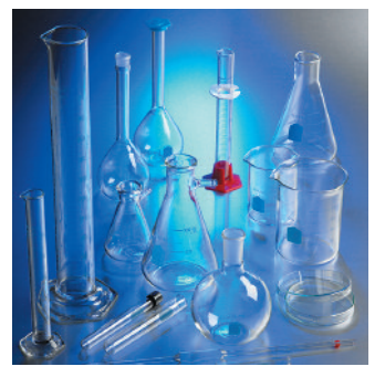
PYREX VISTA glassware offers a full range of economical products from beakers to pipets and is easily recognized by its blue graduations and novel marking spot.

The following pages contain information on the technical properties of various glasses, suggestions on the proper use and care of this glassware, and a glossary of glass terminology.