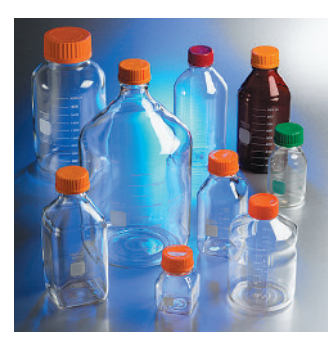
Corning offers a full selection of both reusable and disposable PYREX glass and plastic storage bottles designed to meet the stringent requirements of cell culture.

Cell culture glassware should first be soaked, then washed and repeatedly rinsed with both tap water and high-quality water, i.e., purified by distillation, deionization or reverse osmosis. Special attention should be given to the source of water used during the washing process. Copper tubing is frequently a source of toxic metallic ions in cell culture systems. To eliminate this problem, appropriate plastic or stainless steel tubing can be substituted. Another source of toxic metallic ions may be the hot water heating system used in glassware washing. A separate